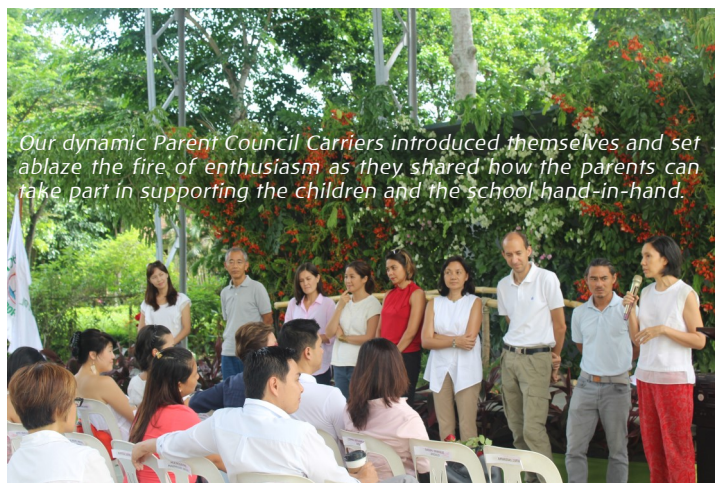
Our dynamic Parent Council Carriers introduced themselves and set ablaze the fire of enthusiasm as they shared how the parents can take part in supporting the children and the school hand-in-hand.