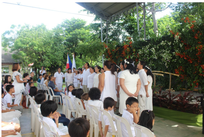
Our talented and gifted teachers and staff who welcomed everyone with their angelic voices as they rendered the songs